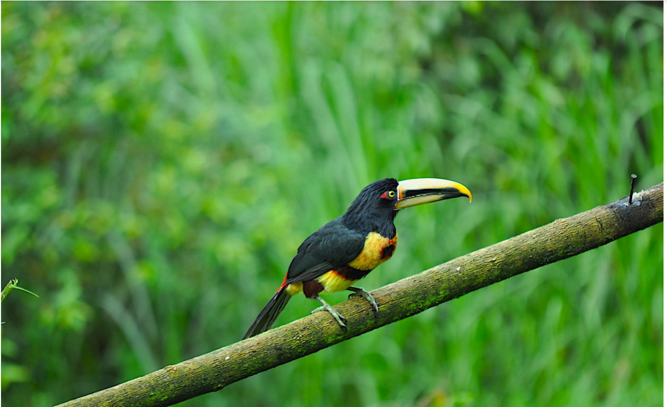
Birding abroad: Pale-mandibled Aracari.